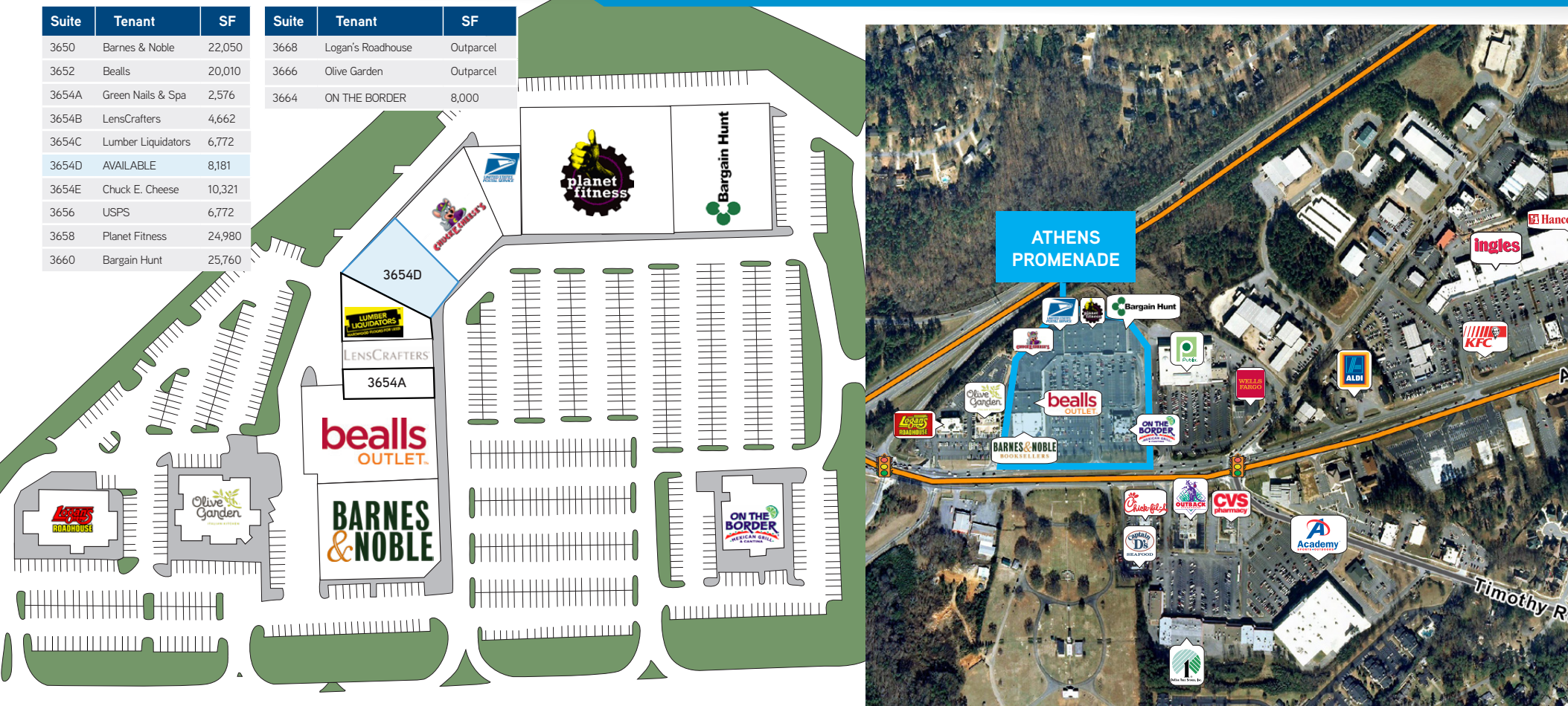
3650 ATLANTA HIGHWAY | ATHENS, GA 30606