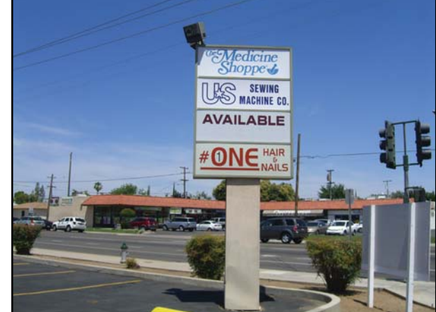
Pole Signage Available