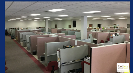
Numerous Work Stations