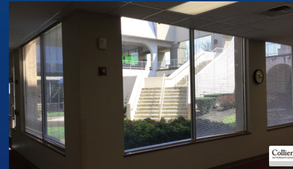
View of Courtyard