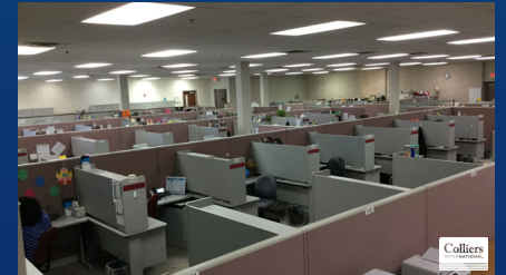
Call Stations in Place