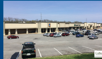
Upper Retail Level of Hendersonville Plaza

+ Tenant pays their own utilities & janitorial services