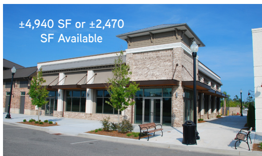
Pedestrian Access to Potential Patio Space