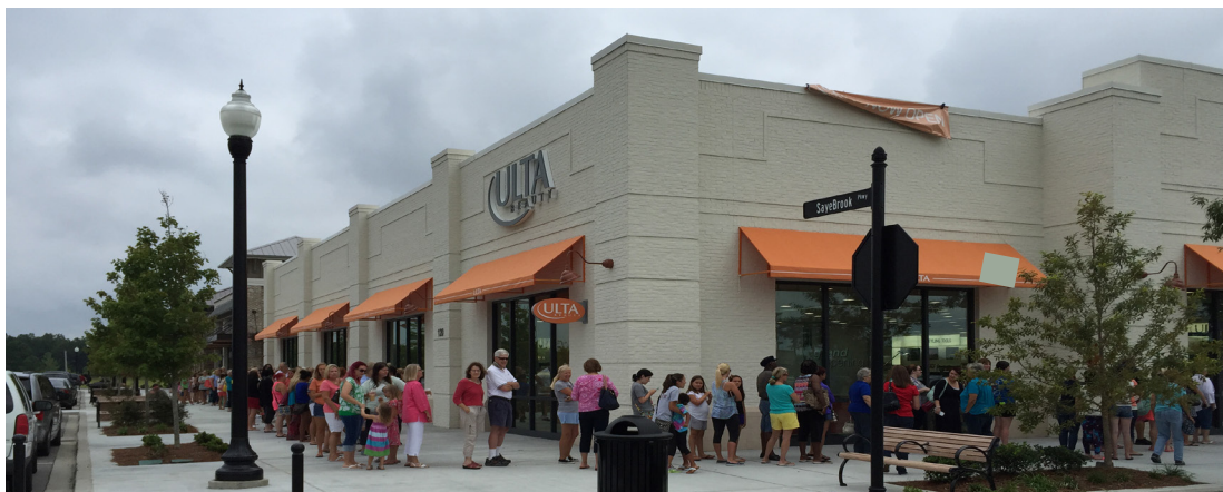
Grand Opening at Ulta on Friday, July 24th 2015

COLLIERS INTERNATIONAL 1301 Gervais Street Suite 600 Columbia, South Carolina 29201 www.colliers.com