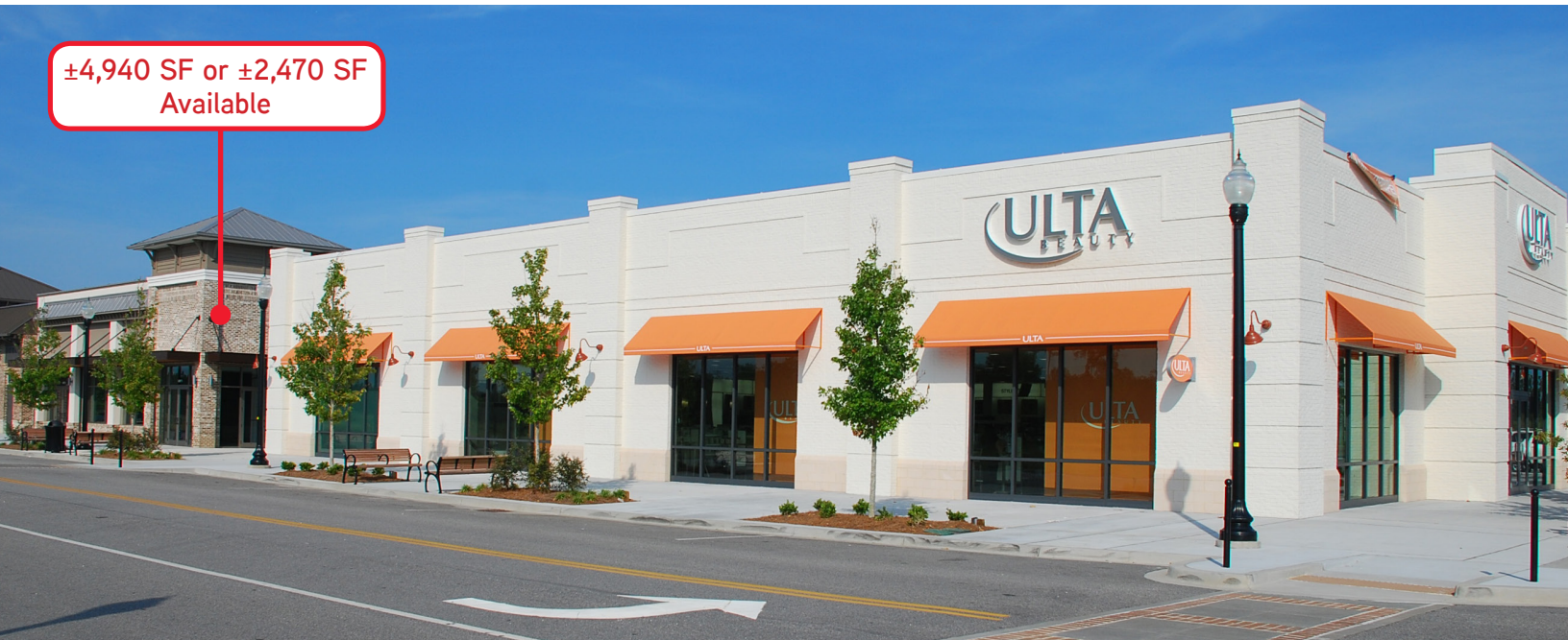
Planned SayeBrook Town Center Main Street Shops Available Space