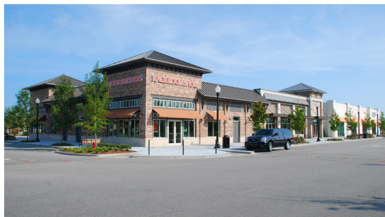
Adjacent to Rack Room Shoes