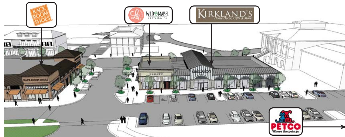
L Mae Boutique and Wild Mabel Coming Soon (Sayebrook Parcel L)