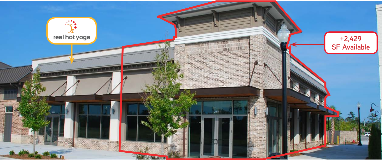
Planned Sayebrook Town Center Main Street Shops Available Space