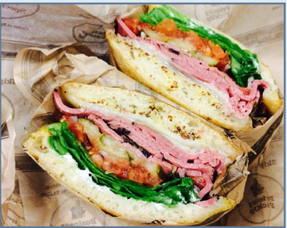
Specialty's Cafe & Bakery