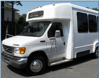
Free Caltrain Shuttle Service