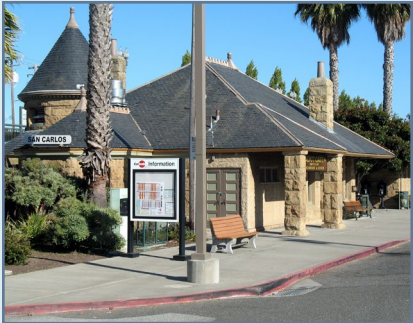
San Carlos Caltrain Station