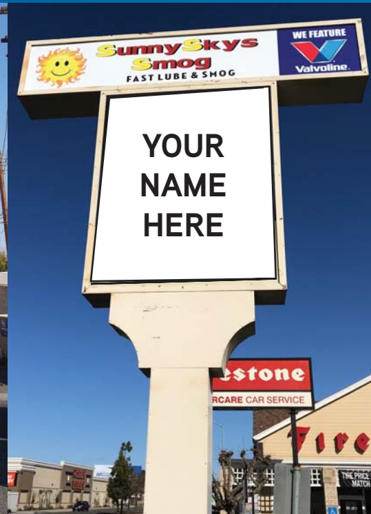
Blackstone Avenue Pylon Sign