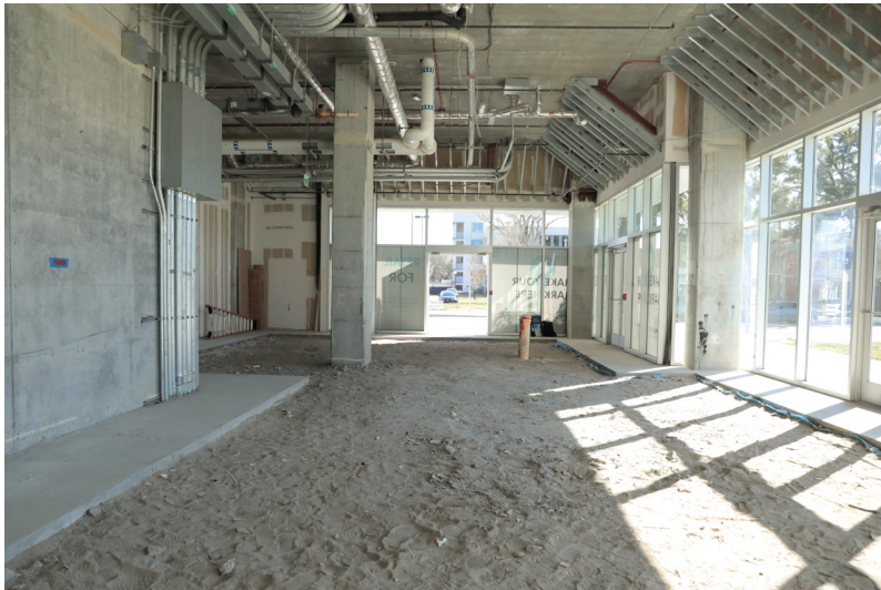
2,548 SF with Outdoor Patio