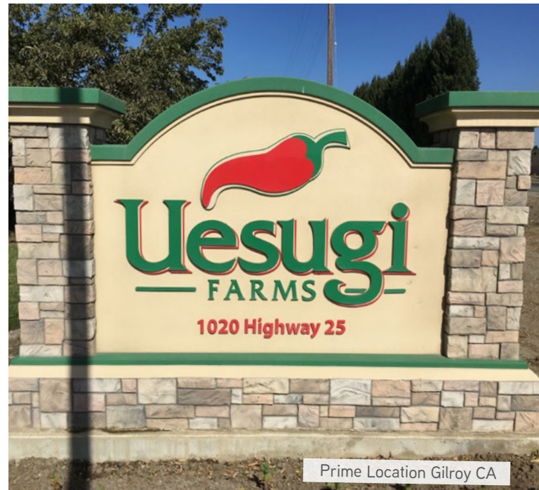
Prime Location Gilroy CA