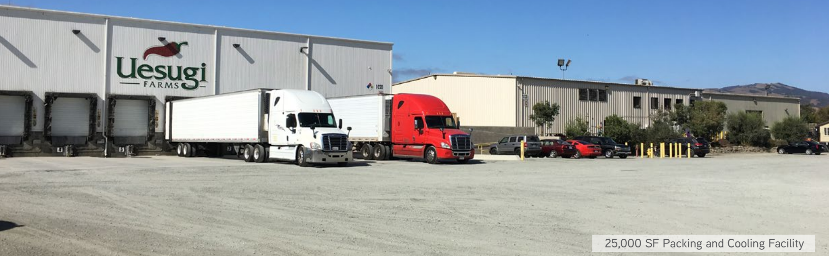
25,000 SF Packing and Cooling Facility