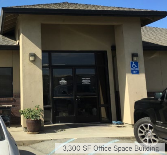
3,300 SF Office Space Building