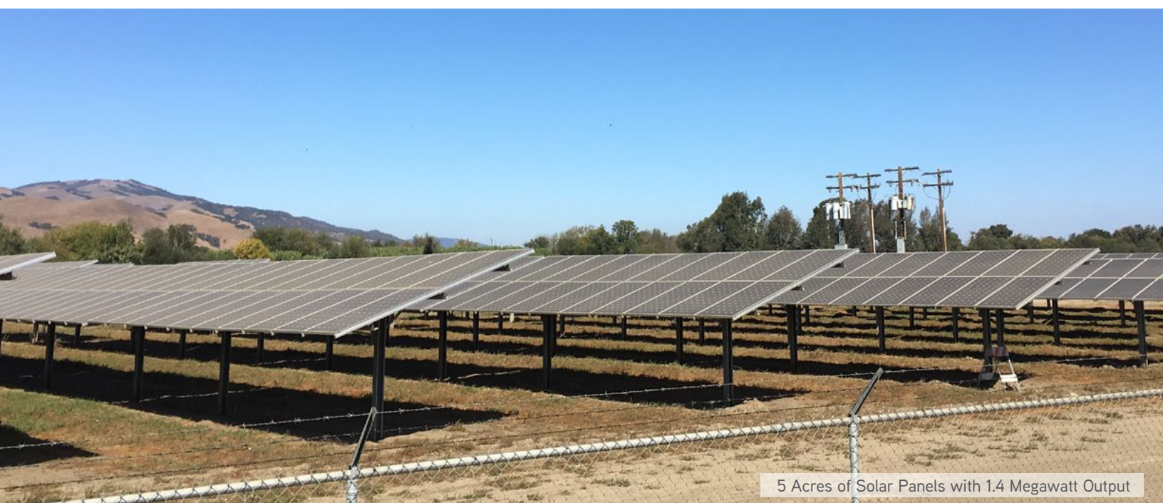
5 Acres of Solar Panels with 1.4 Megawatt Output