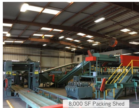
8,000 SF Packing Shed