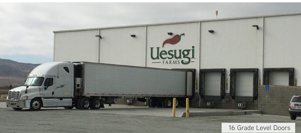
16 Grade Level Doors