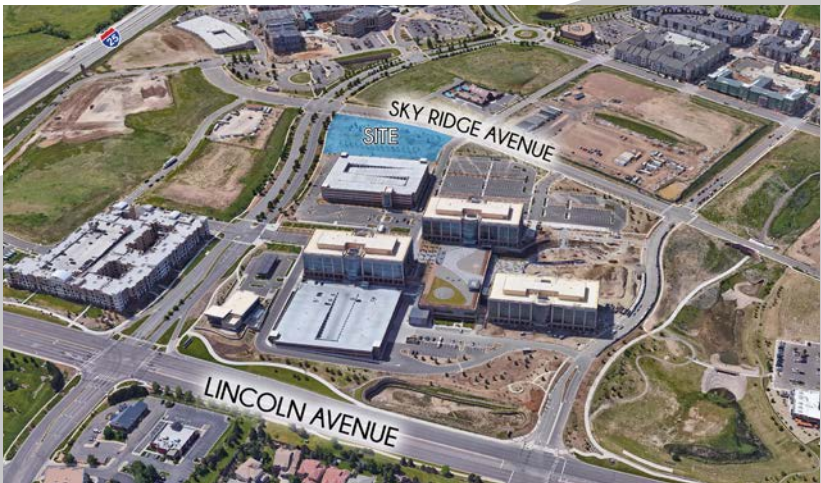
Birds Eye View Looking North