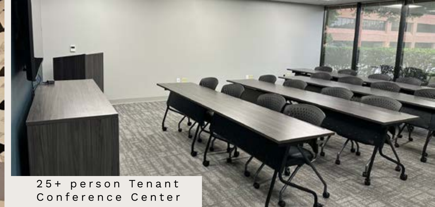
25+ person Tenant Conference Center