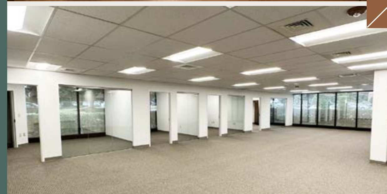
Move-in ready suites