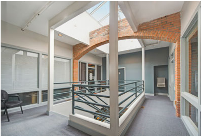
Top floor, office exteriors, skylight, stairs