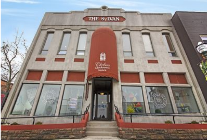
Sylvan Building, sidewalk front view