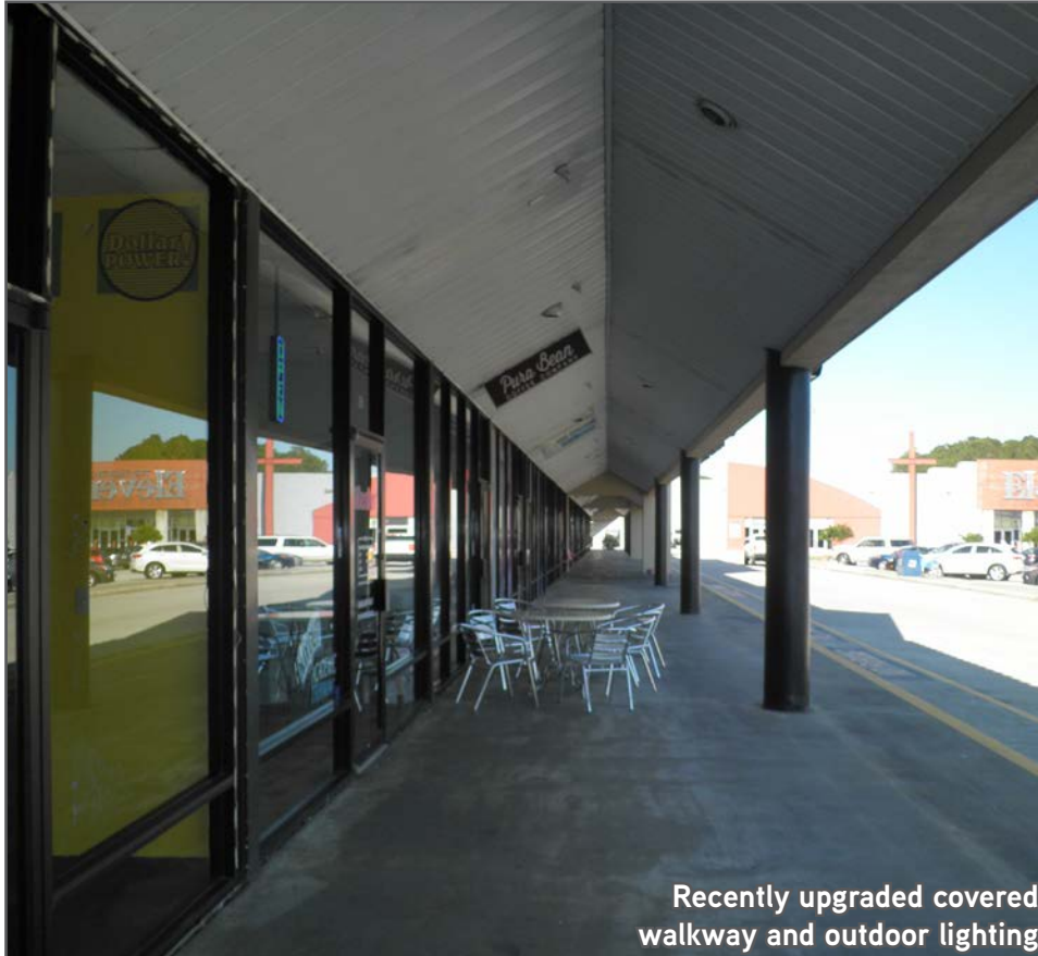
Recently upgraded covered walkway and outdoor lighting

14286 BEACH BLVD., JACKSONVILLE, FL 32250