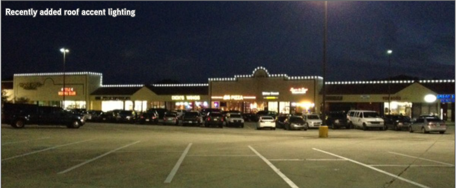
Recently added roof accent lighting

14286 BEACH BLVD., JACKSONVILLE, FL 32250