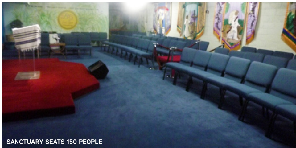
SANCTUARY SEATS 150 PEOPLE