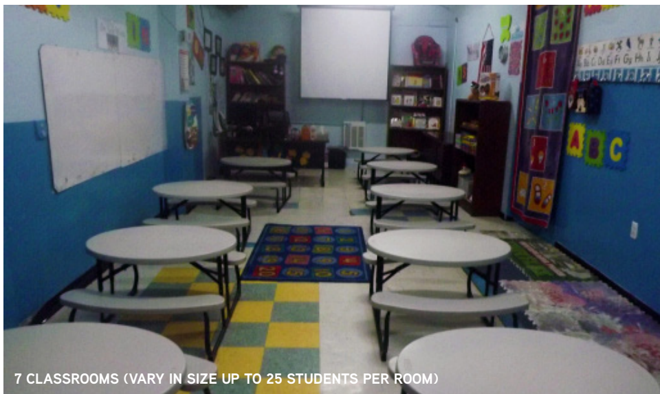
7 CLASSROOMS (VARY IN SIZE UP TO 25 STUDENTS PER ROOM)