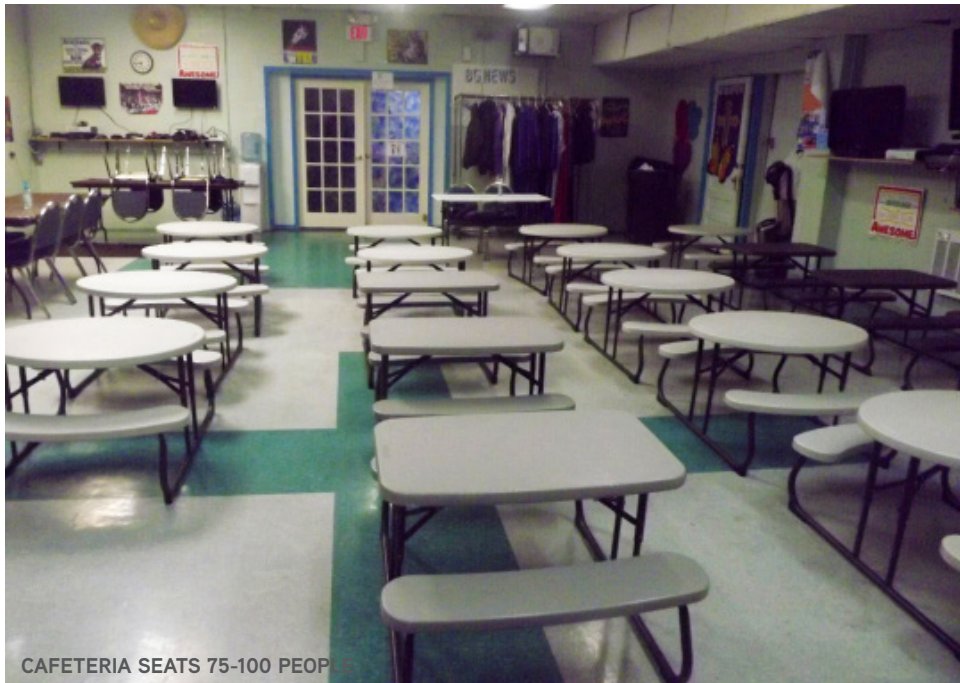
CAFETERIA SEATS 75-100 PEOPLE

COLLIERS INTERNATIONAL 7200 Glen Forest Drive | Suite 200 Richmond, VA 23226 www.colliers.com/richmond