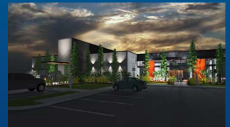
Exterior Rendering with Expansion