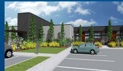
Exterior Rendering with Expansion