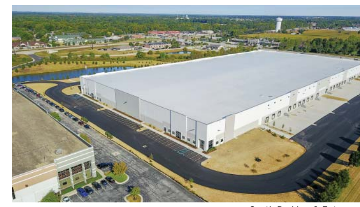
South Parking & Entrance