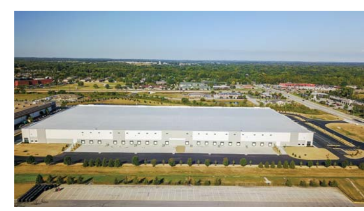
East Truck Court