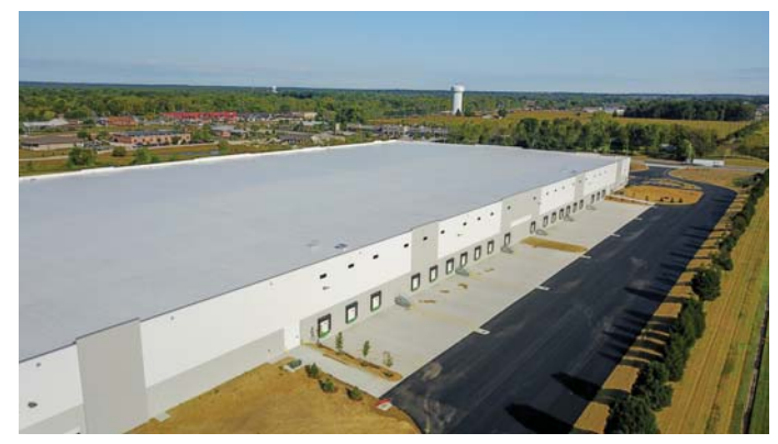
East Truck Court