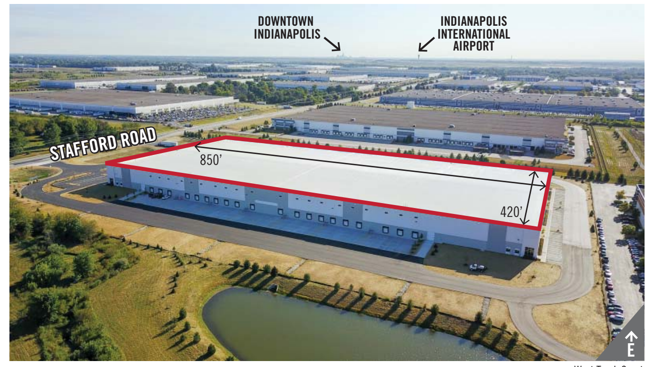
West Truck Court