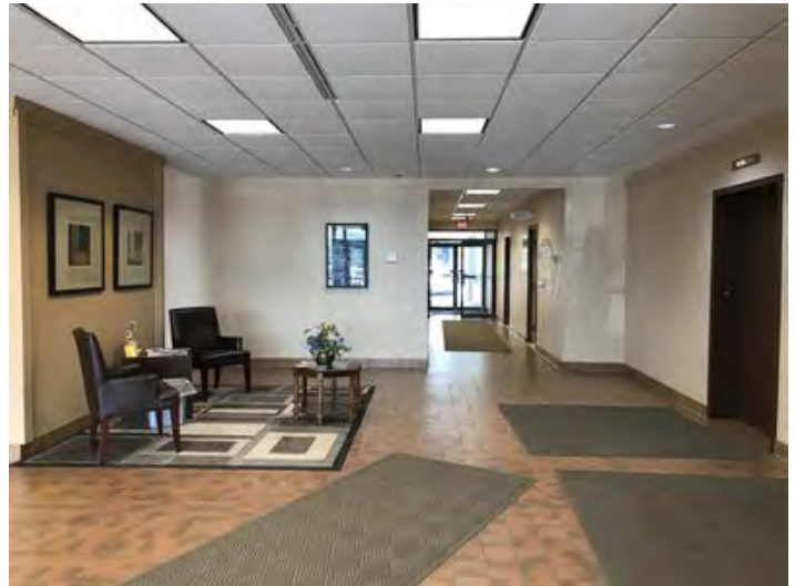
Main Entrance Lobby