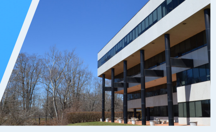
LAN EXECUTIVE CENTER

Superior class office building offering the highest quality image at affordable rates!