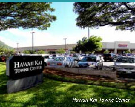
Hawaii Kai Towne Center