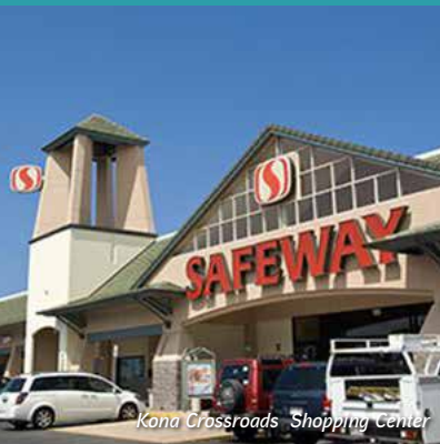
Kona Crossroads Shopping Center

ValueRock Realty Partners is one of the nation's leading real estate investment and operating companies. With a focus on retail, ValueRock believes that to be successful, a retail center needs to have a prime location, strategic leasing, hands-on management and a creative business plan to enable it to compete effectively in its marketplace. With that vision at the forefront, ValueRock has assembled a portfolio of retail properties across the major Hawaiian islands and is one of Hawaii's largest retail property owners, offering its tenants a unique opportunity to locate in multiple key markets in Hawaii.