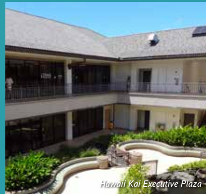
Hawaii Kai Executive Plaza