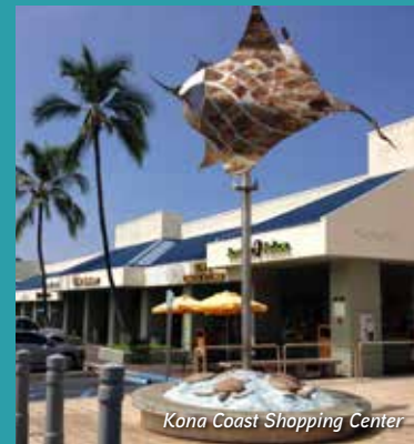
Kona Coast Shopping Center