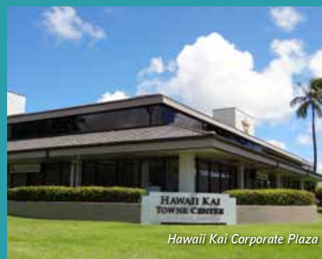
Hawaii Kai Corporate Plaza