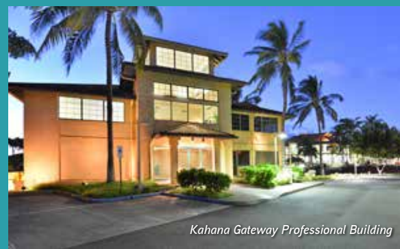
Kahana Gateway Professional Building