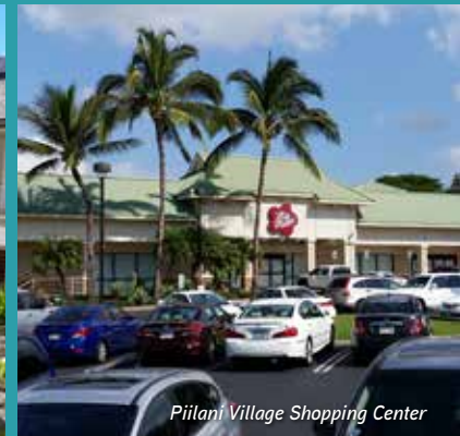
Piilani Village Shopping Center