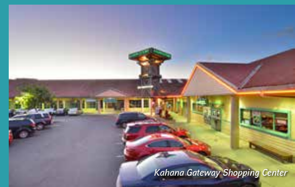
Kahana Gateway Shopping Center