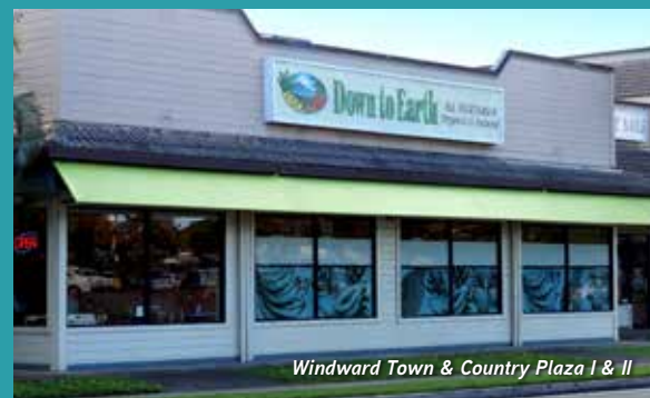
Woodward Town & Country Plaza I & II