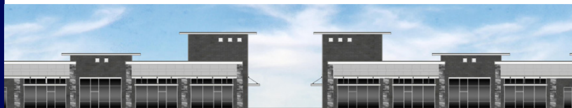
CADENCE PLAZA - SPRINGDALE ARKANSAS

New construction Class "A" retail buildings pre-leasing for the summer of 2026, located on bustling W Sunset Avenue in Springdale, Arkansas. The property is slightly east of the Interstate 49 and Highway 412 intersection and is minutes from Springdale's Care Corridor. The property benefits from the surrounding dense residential neighborhoods and location on the city's major retail and business corridor. Potential for drive-thru and patio with ample well-lit parking.