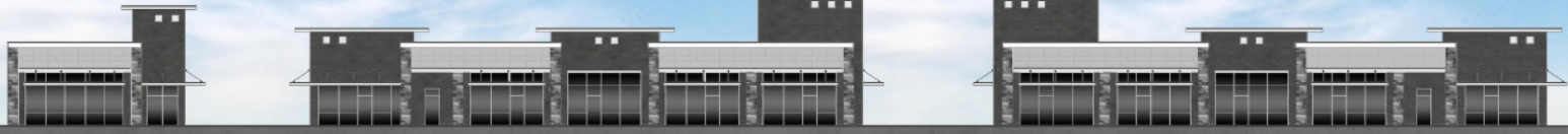
CADENCE PLAZA - SPRINGDALE ARKANSAS