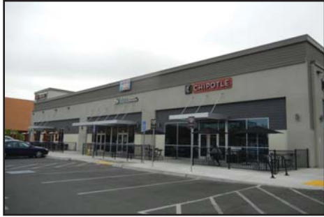
Habit Burger | Rita's Ice | Chipotle