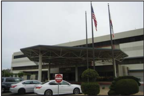
Senior Resource Center