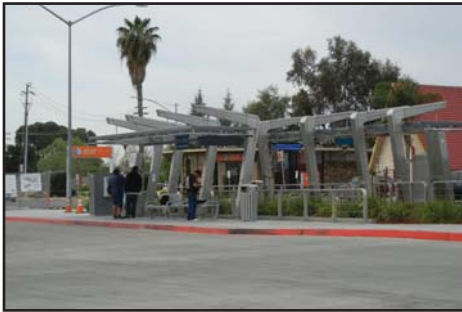
Major Bus Transit Station