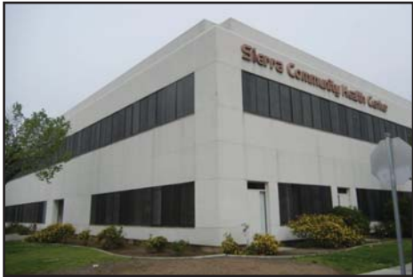
Sierra Community Health Center