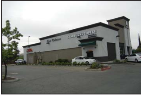
Panda Express | Starbucks