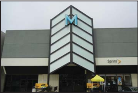
Manchester Center Mall