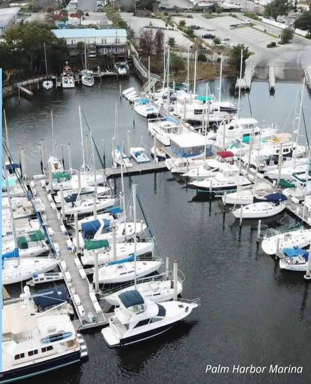
Palm Harbor Marina