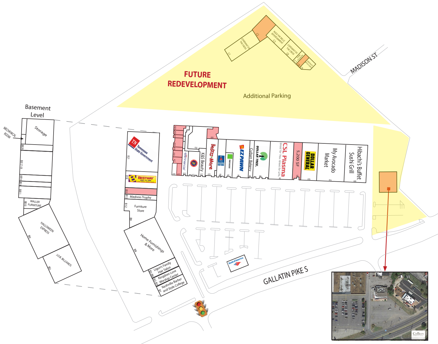
Former Shoney's Parcel ±1.74 acres for Ground Lease or Build-to-Suit