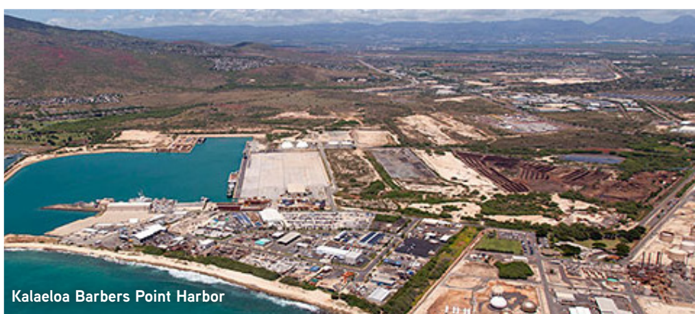
Kalaeloa Barbers Point Harbor