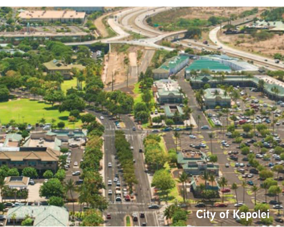
City of Kapolei