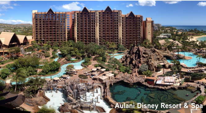
Aulani Disney Resort & Spa