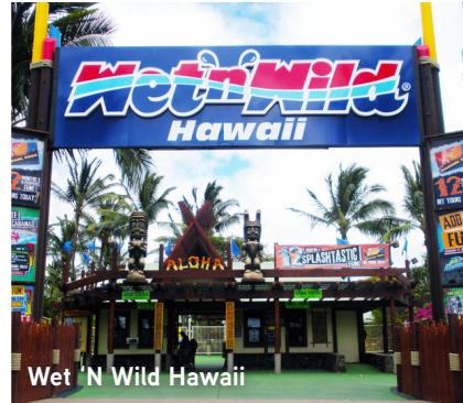
Wet 'N Wild Hawaii