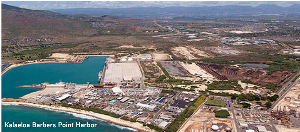
Kalaeloa Barbers Point Harbor