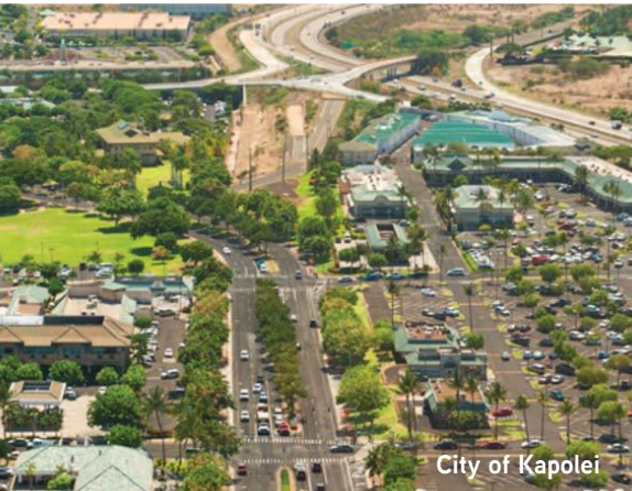
City of Kapolei