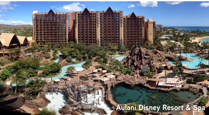
Aulani Disney Resort & Spa