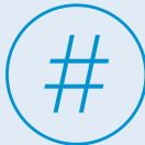
Median Age (2018)