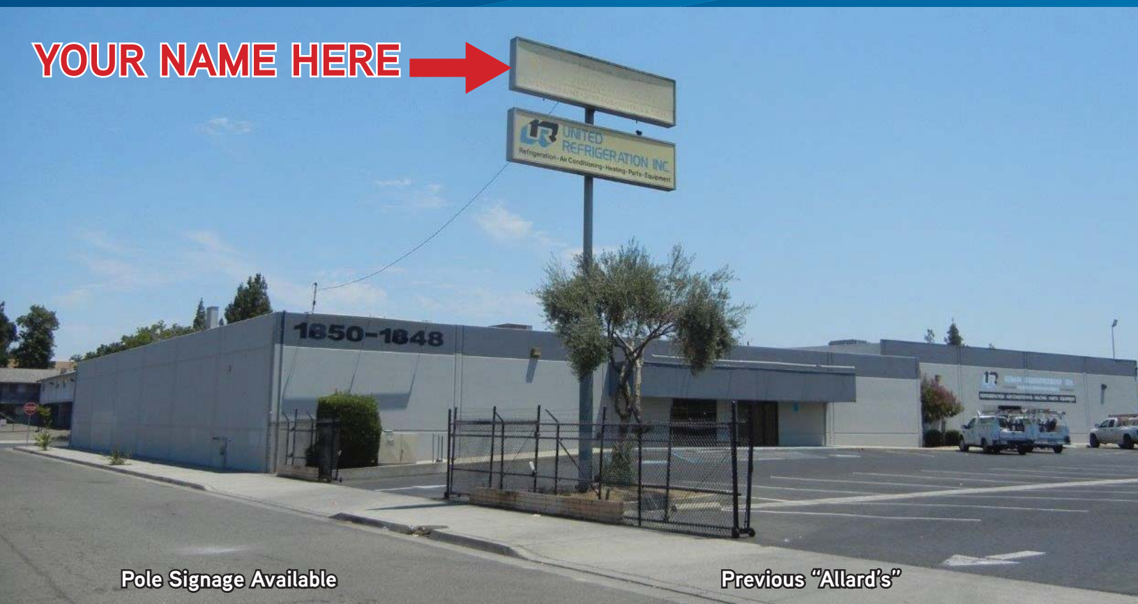
Pole Signage Available