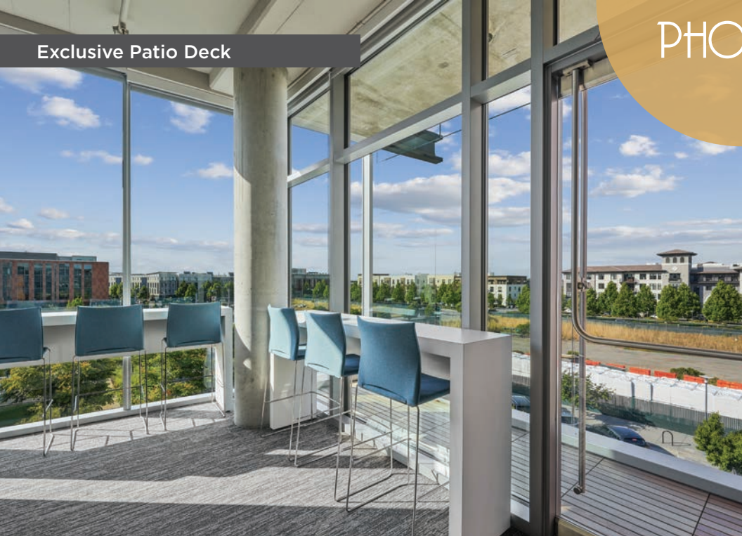
Exclusive Patio Deck