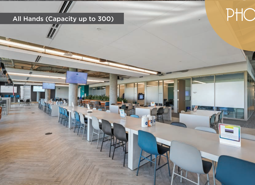
All Hands (Capacity up to 300)