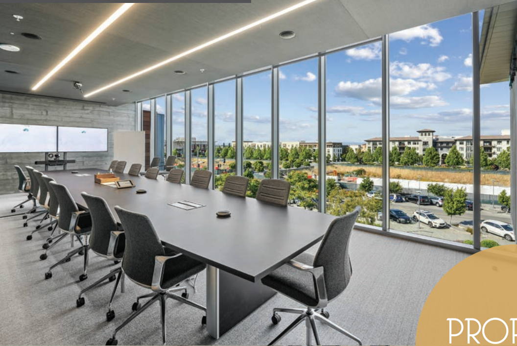
Executive Board Room (Seats 18-20)