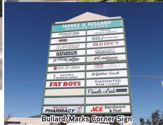
Bullard/Marks Corner Sign