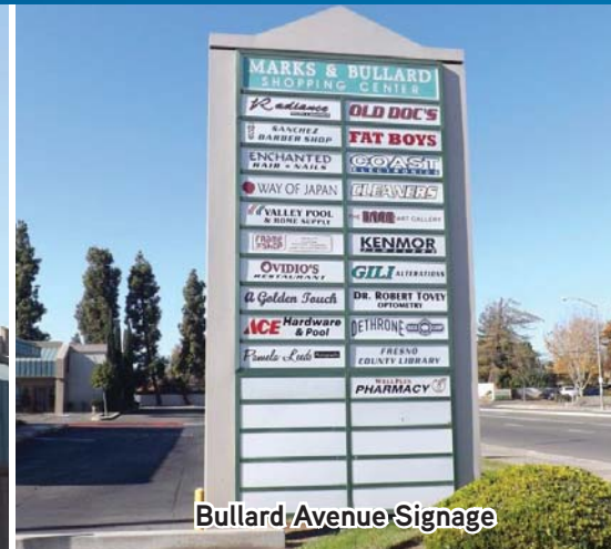
Bullard Avenue Signage