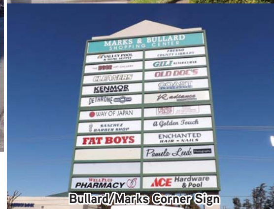
Bullard/Marks Corner Sign