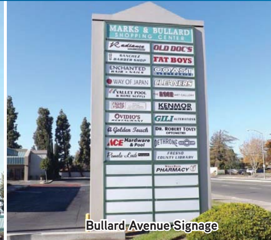
Bullard Avenue Signage