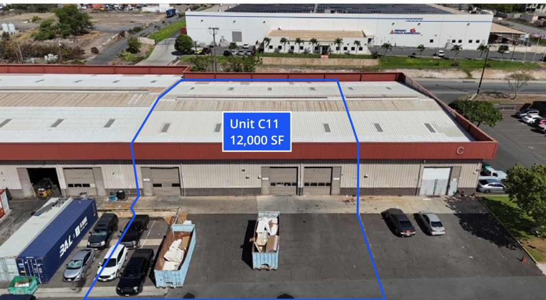
Unit C11 12,000 SF