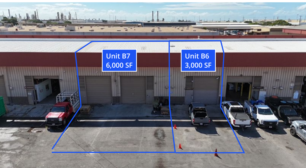
Unit B7 6,000 SF