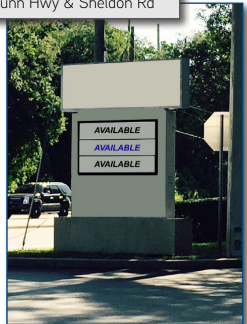
Monuments on Gunn Hwy & Sheldon Rd