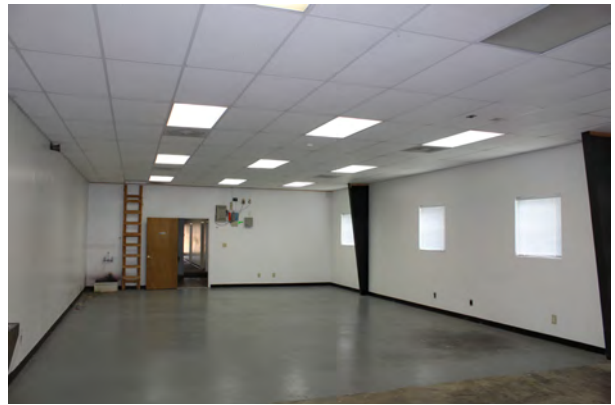
Open Warehouse with dropped ceiling