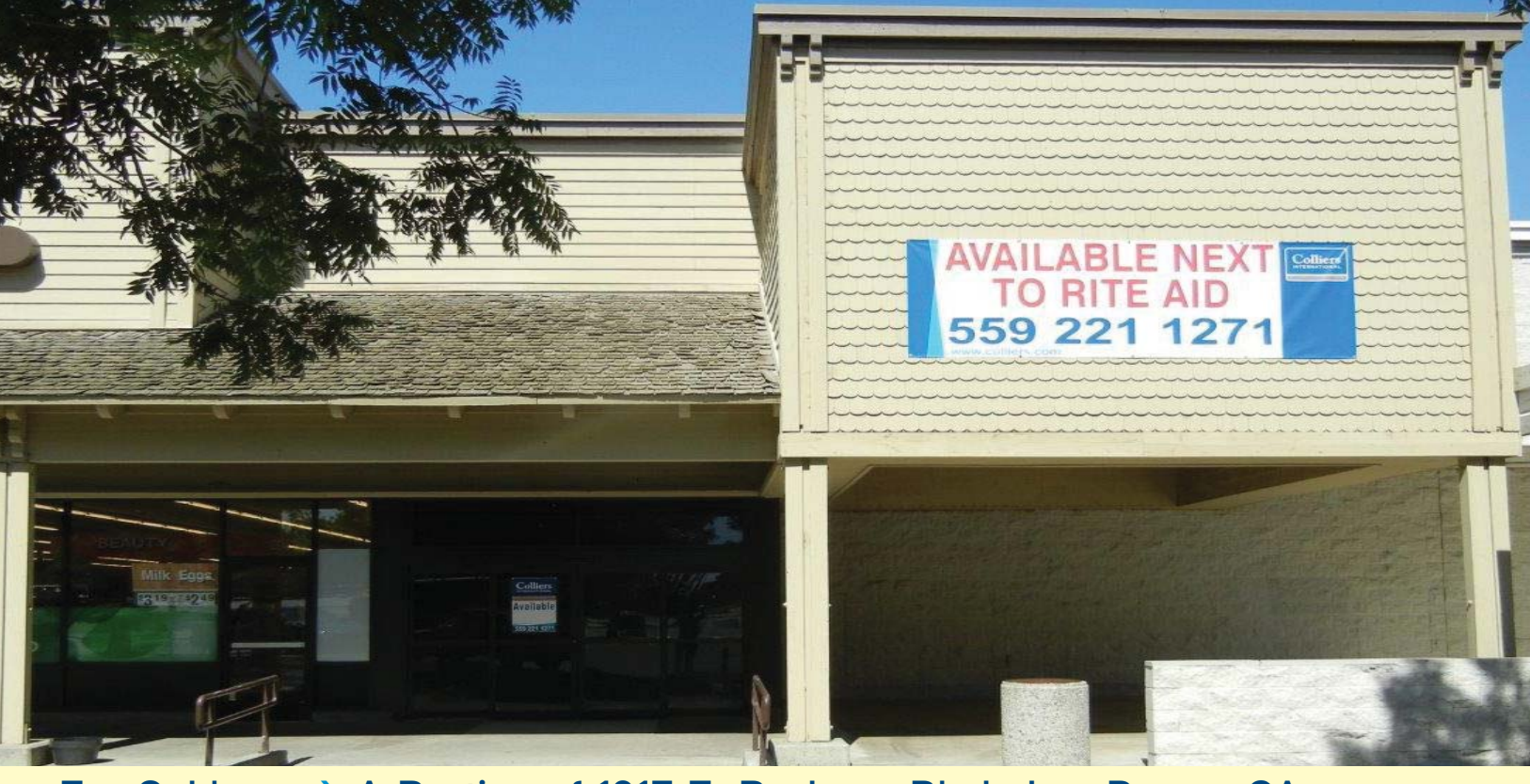
For Sublease > A Portion of 1317 E. Pacheco Blvd., Los Banos, CA