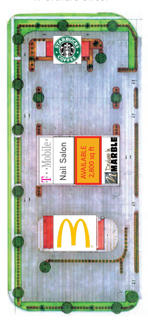
W Orchard Street