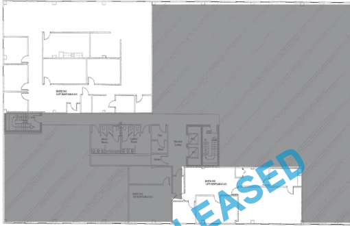
SUITE 302 ±1,675 RSF