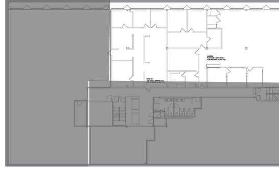
SUITE 301 ±4,002 RSF