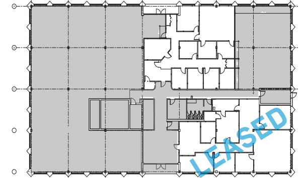
SUITE 100 ±3,175 RSF