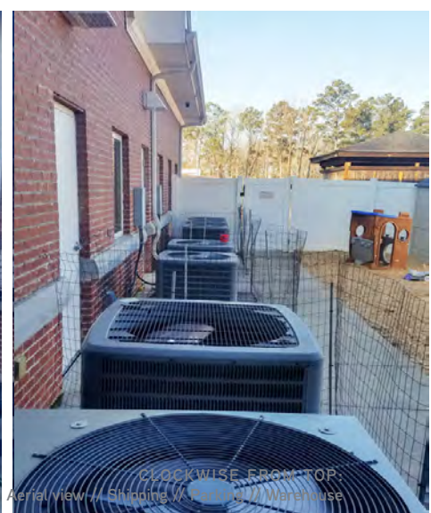
CLOCKWISE FROM TOP: Aerial View // Shipping // Warehouse