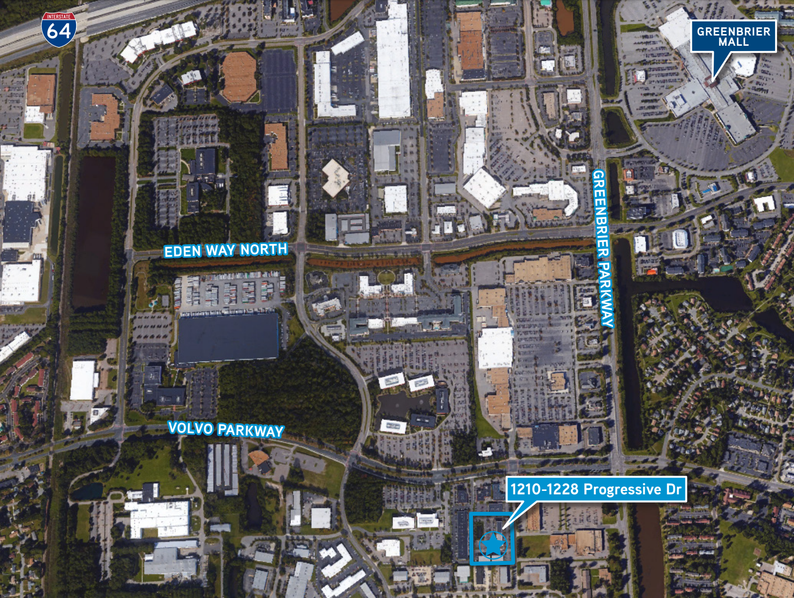
Aerial Photo - 1210-1228 Progressive Drive, Chesapeake | VA 23320