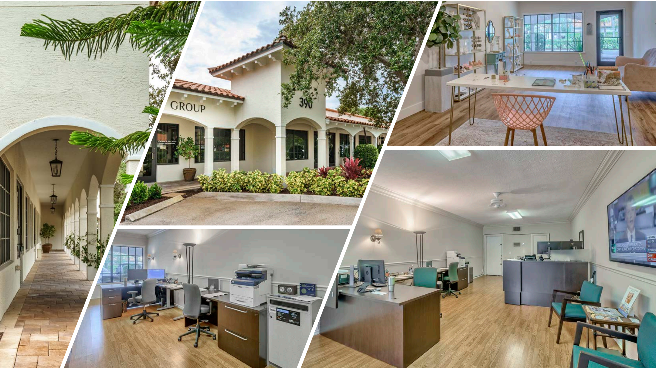
CLOCKWISE FROM TOP LEFT: Walkway; Front of building; Interior image of suite; Front view of interior suite; Rear of interior suite