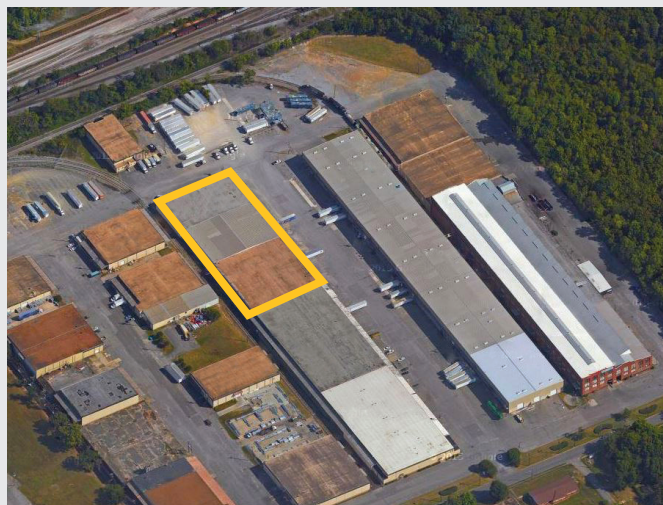
Location Aerial View

COLLIERS INTERNATIONAL 880 Montclair Road, Suite 250 Birmingham, AL 35213 +1 205 445 0955 www.colliers.com | alabama