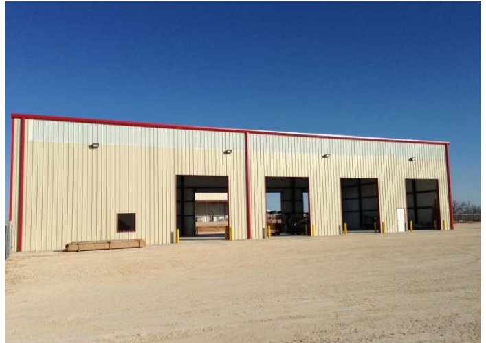
Example - Right Side with Drive-Through Doors