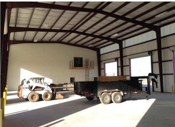
Example - Warehouse Interior