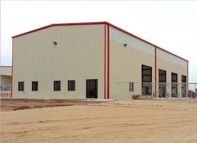
Example - Building Photo