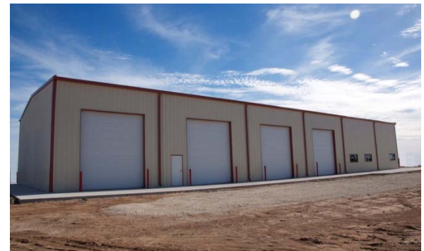
Example of Typical Building