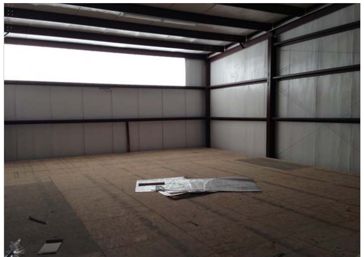
Example - 2 nd Floor Light Storage/Mechanical Room

Colliers International is a worldwide affiliation of independently owned and operated companies. The information contained herein has, we believe, been obtained from reliable sources and we have no reason to doubt the accuracy thereof. All such information is submitted, subject to errors, omissions or changes in condition prior to sale, lease or withdrawal without notice. All information contained herein should be verified by the person relying thereon. We have not made and will not make any warranty or representation as to the condition of the property nor the presence of any hazardous substances or any environmental or other conditions that may affect the value or suitability of the property.