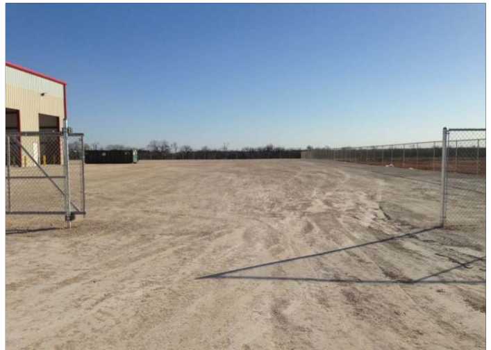
Example - Entrance to Yard