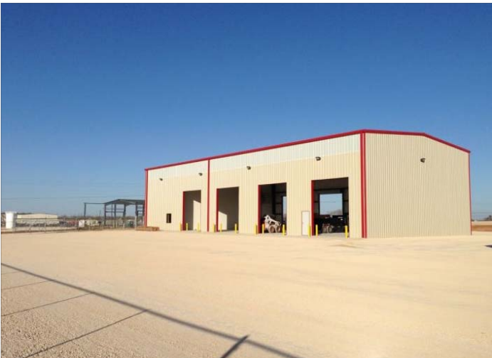
Example - Rear of Yard and Building