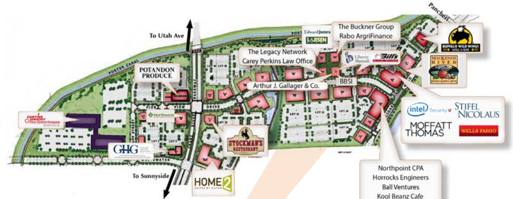
PIER VIEW SITE PLAN