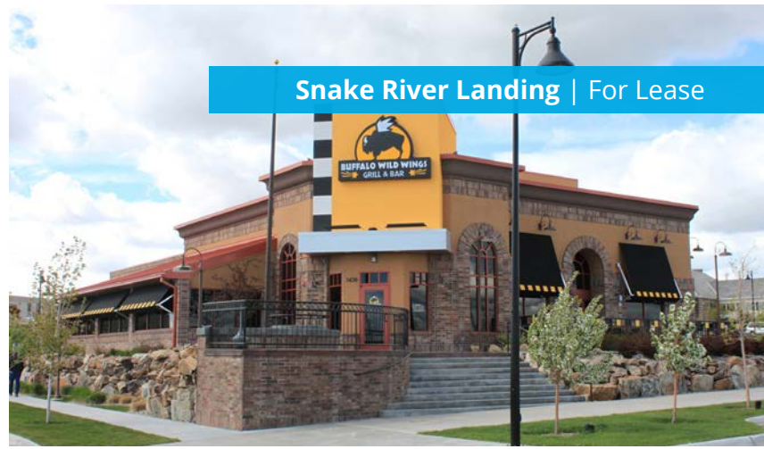
Snake River Landing | For Lease