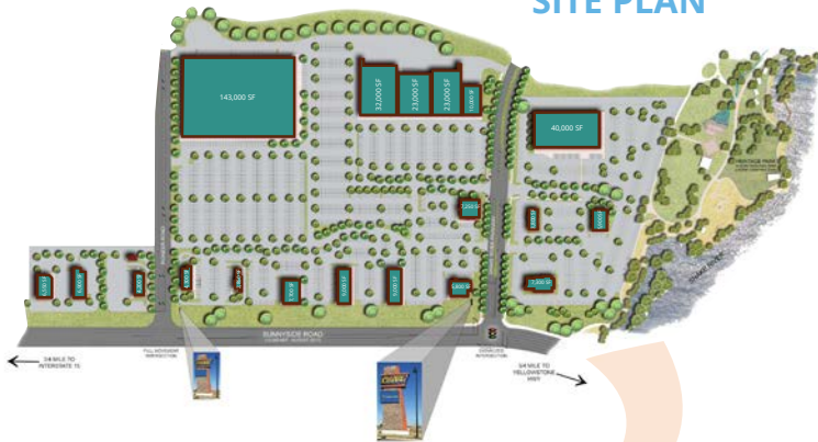
THE COMMONS SITE PLAN