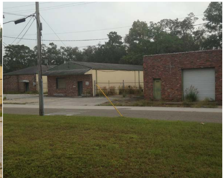
Front view of building 1, 3, and 5