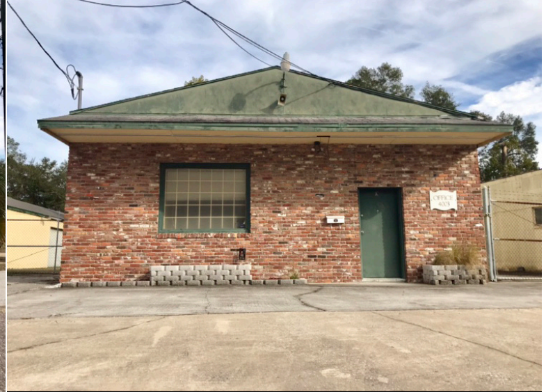
Building 3 - 2,480 SF