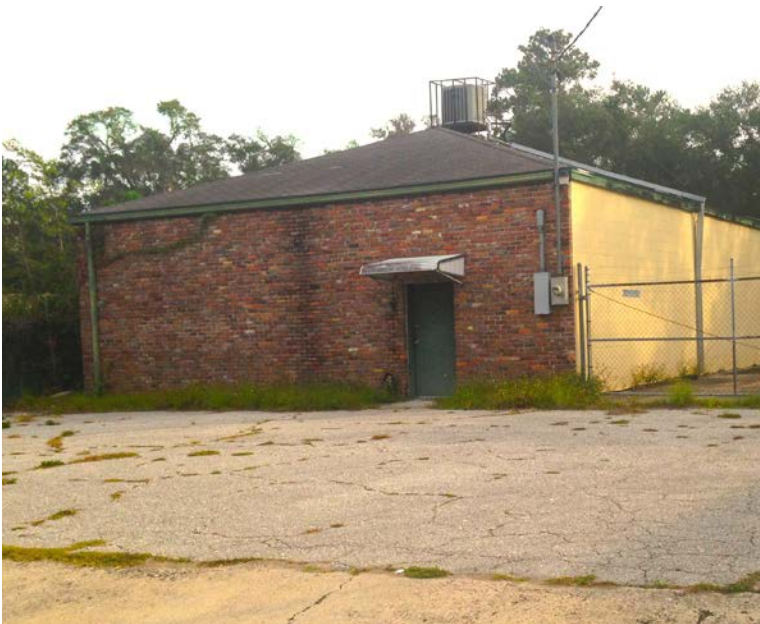
Building 5 - 5,400 SF