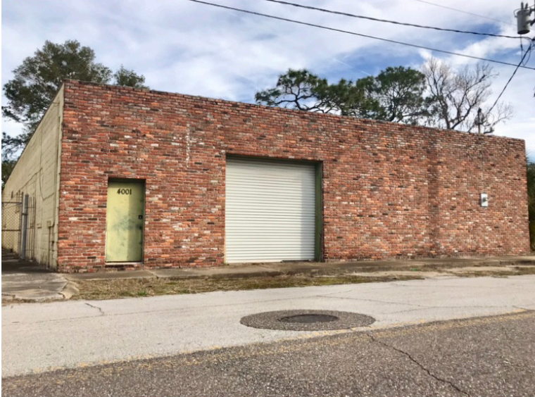
Building 1 - 5,353 SF

4003 N. LIBERTY STREET, JACKSONVILLE, FL