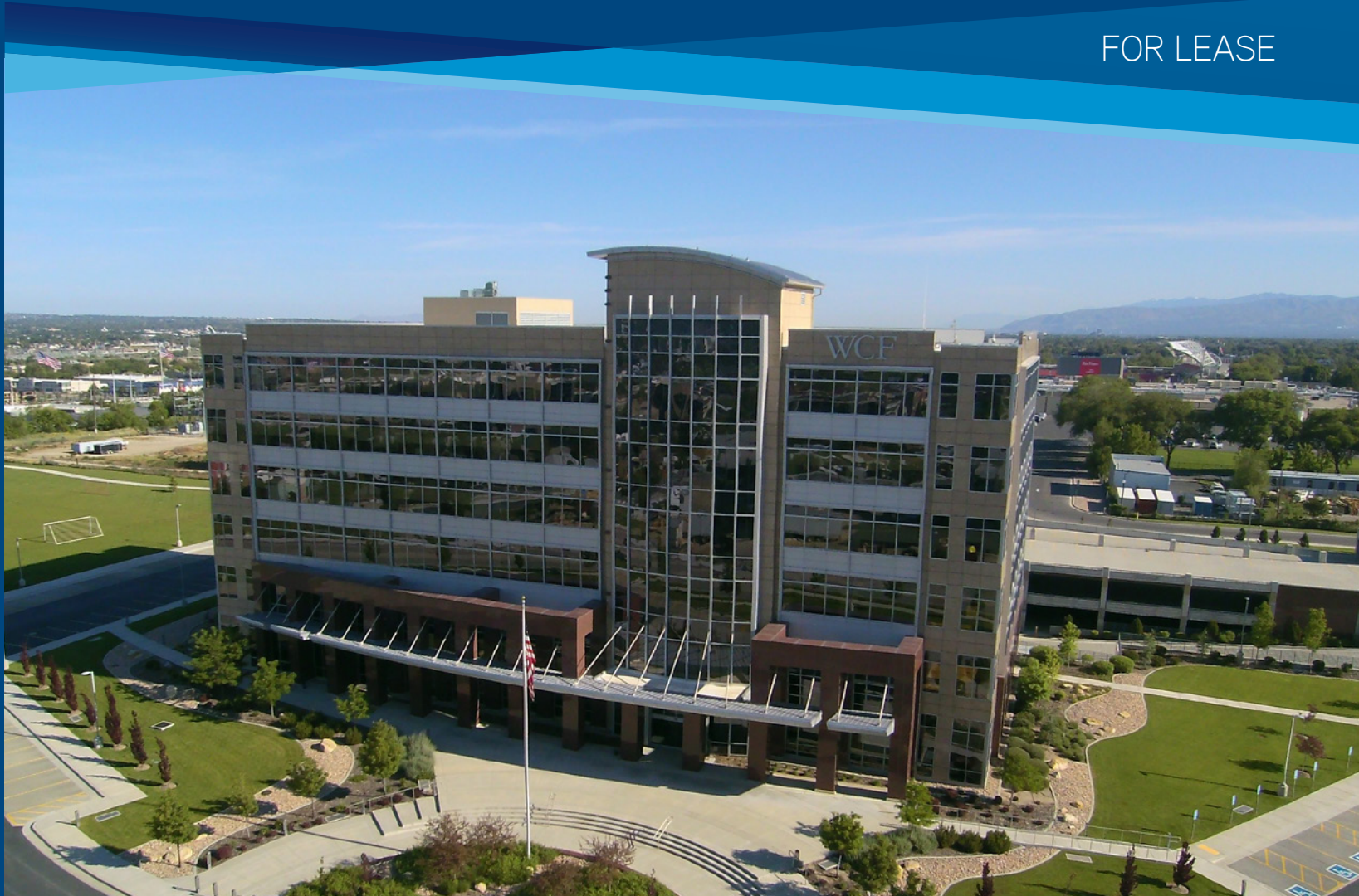
100 WEST TOWNE RIDGE PARKWAY, SANDY, UTAH