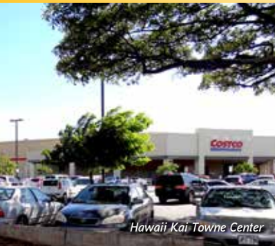
Hawaii Kai Towne Center