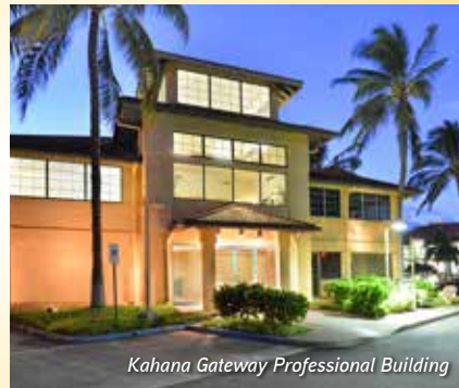
Kahana Gateway Professional Building