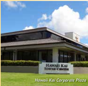
Hawaii Kai Corporate Plaza