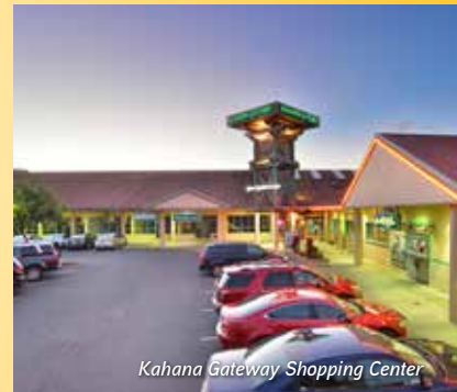
Kahana Gateway Shopping Center