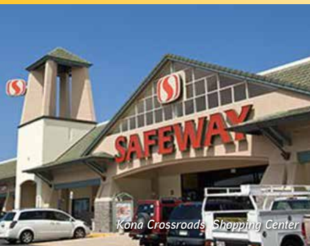
Kona Crossroads Shopping Center