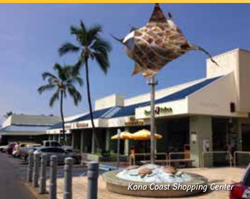
Kona Coast Shopping Center

ValueRock Realty Partners is one of the nation's leading real estate investment and operating companies. With a focus on retail, ValueRock believes that to be successful, a retail center needs to have a prime location, strategic leasing, hands-on management and a creative business plan to enable it to compete effectively in its marketplace. With that vision at the forefront, ValueRock has assembled a portfolio of retail properties across the major Hawaiian islands and is one of Hawaii's largest retail property owners, offering its tenants a unique opportunity to locate in multiple key markets in Hawaii.