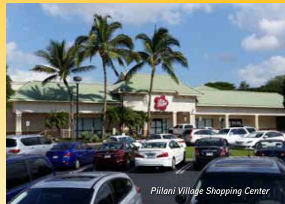
Piilani Village Shopping Center