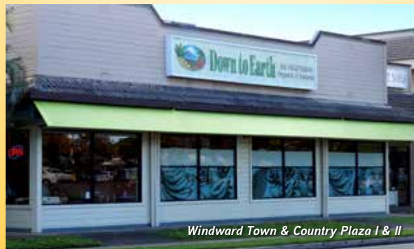
Windward Town & Country Plaza I & II