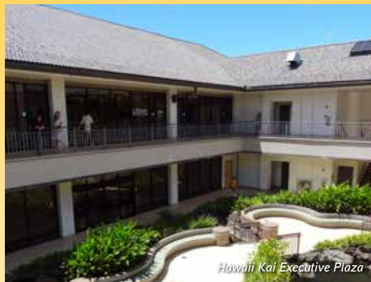
Hawaii Kai Executive Plaza