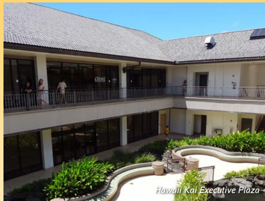
Hawaii Kai Executive Plaza