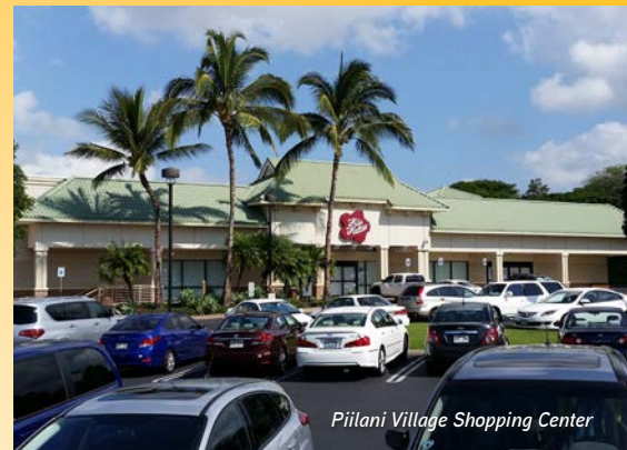
Piilani Village Shopping Center