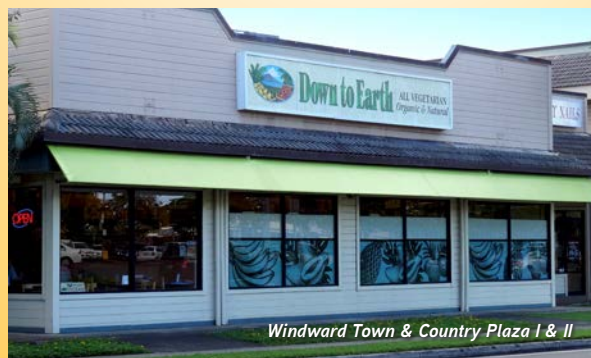
Woodward Town & Country Plaza I & II