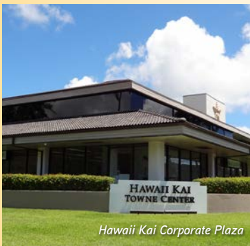
Hawaii Kai Corporate Plaza