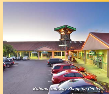
Kahana Gateway Shopping Center