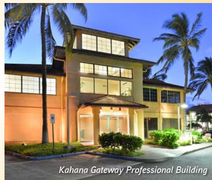
Kahana Gateway Professional Building