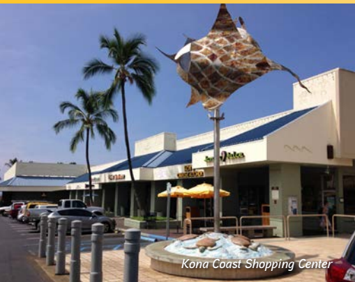
Kona Coast Shopping Center

ValueRock Realty Partners is one of the nation's leading real estate investment and operating companies. With a focus on retail, ValueRock believes that to be successful, a retail center needs to have a prime location, strategic leasing, hands-on management and a creative business plan to enable it to compete effectively in its marketplace. With that vision at the forefront, ValueRock has assembled a portfolio of retail properties across the major Hawaiian islands and is one of Hawaii's largest retail property owners, offering its tenants a unique opportunity to locate in multiple key markets in Hawaii.