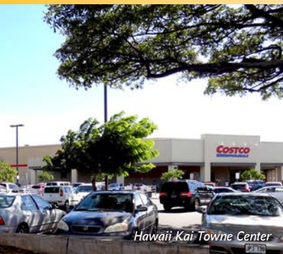
Hawaii Kai Towne Center