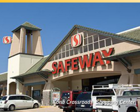
Kona Crossroads Shopping Center