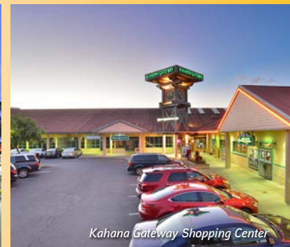
Kahana Gateway Shopping Center