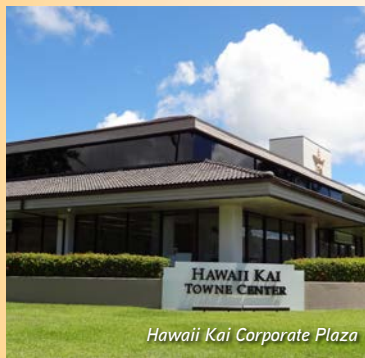
Hawaii Kai Corporate Plaza