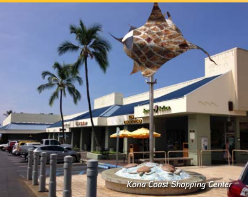
Kona Coast Shopping Center

ValueRock Realty Partners is one of the nation's leading real estate investment and operating companies. With a focus on retail, ValueRock believes that to be successful, a retail center needs to have a prime location, strategic leasing, hands-on management and a creative business plan to enable it to compete effectively in its marketplace. With that vision at the forefront, ValueRock has assembled a portfolio of retail properties across the major Hawaiian islands and is one of Hawaii's largest retail property owners, offering its tenants a unique opportunity to locate in multiple key markets in Hawaii.