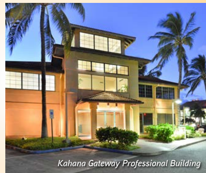
Kahana Gateway Professional Building