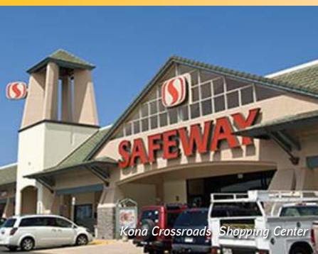
Kona Crossroads Shopping Center