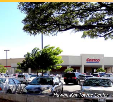
Hawaii Kai Towne Center