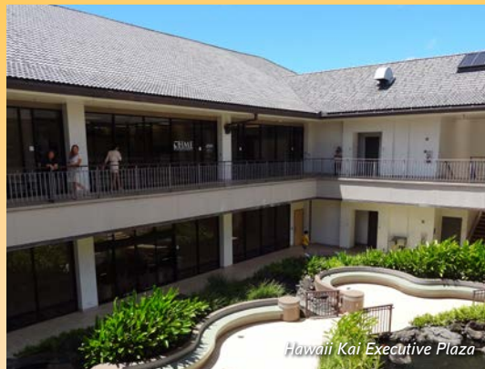
Hawaii Kai Executive Plaza