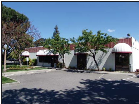
Front Area Parking