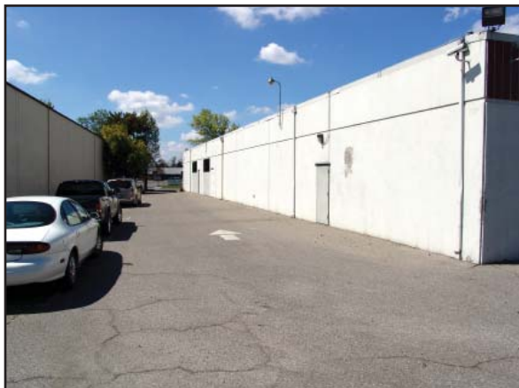
South End of Building & Parking