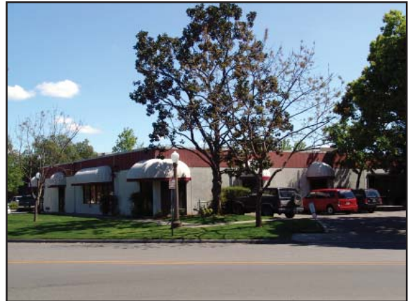
Northwest Portion of Building & Parking