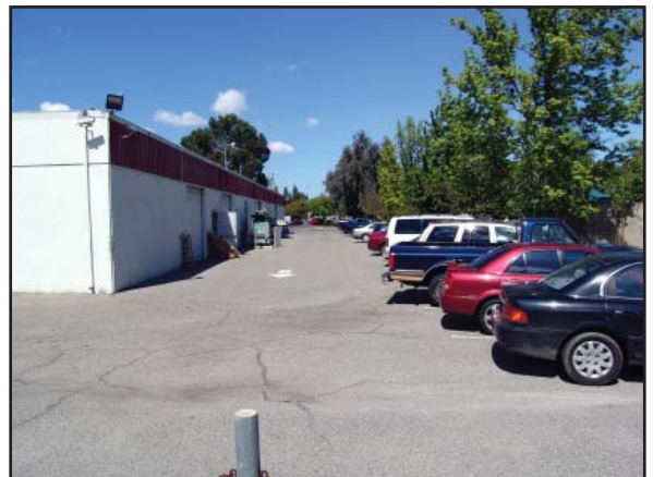
Rear Parking Area