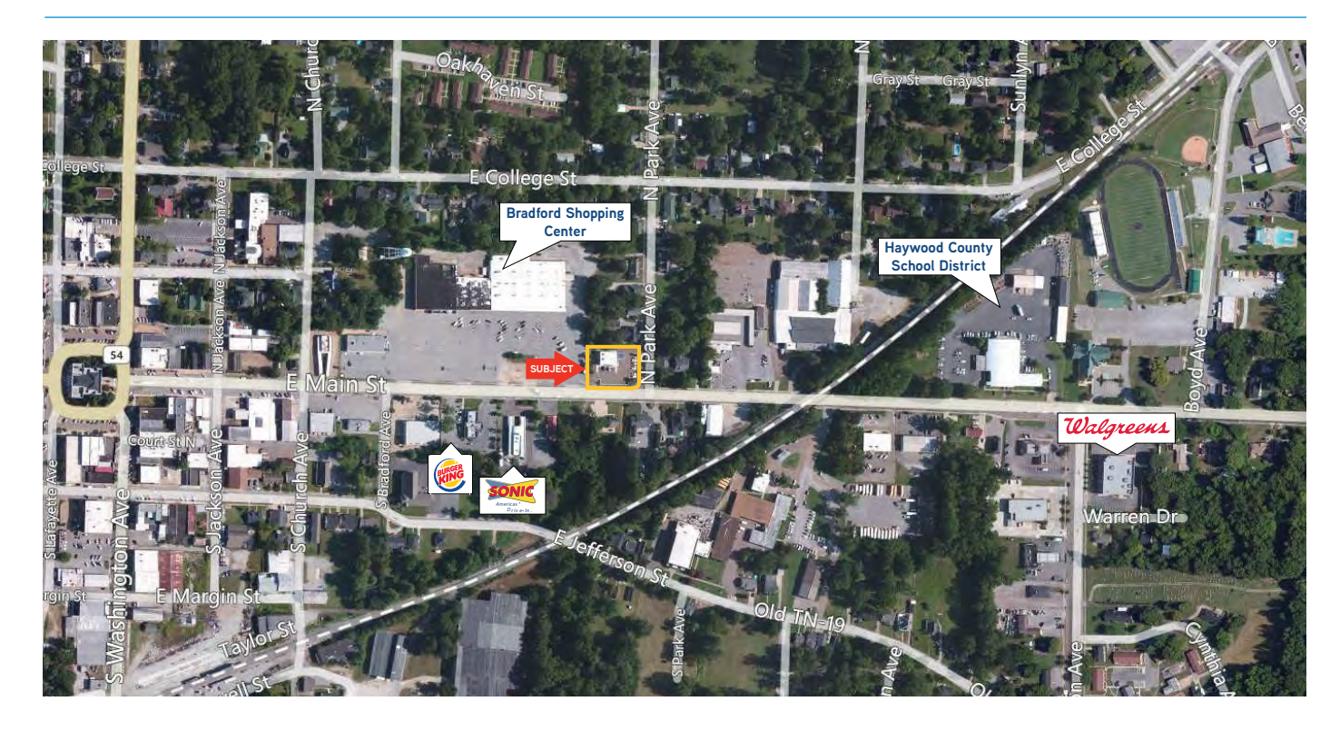
511 E. Main Street > Location Map