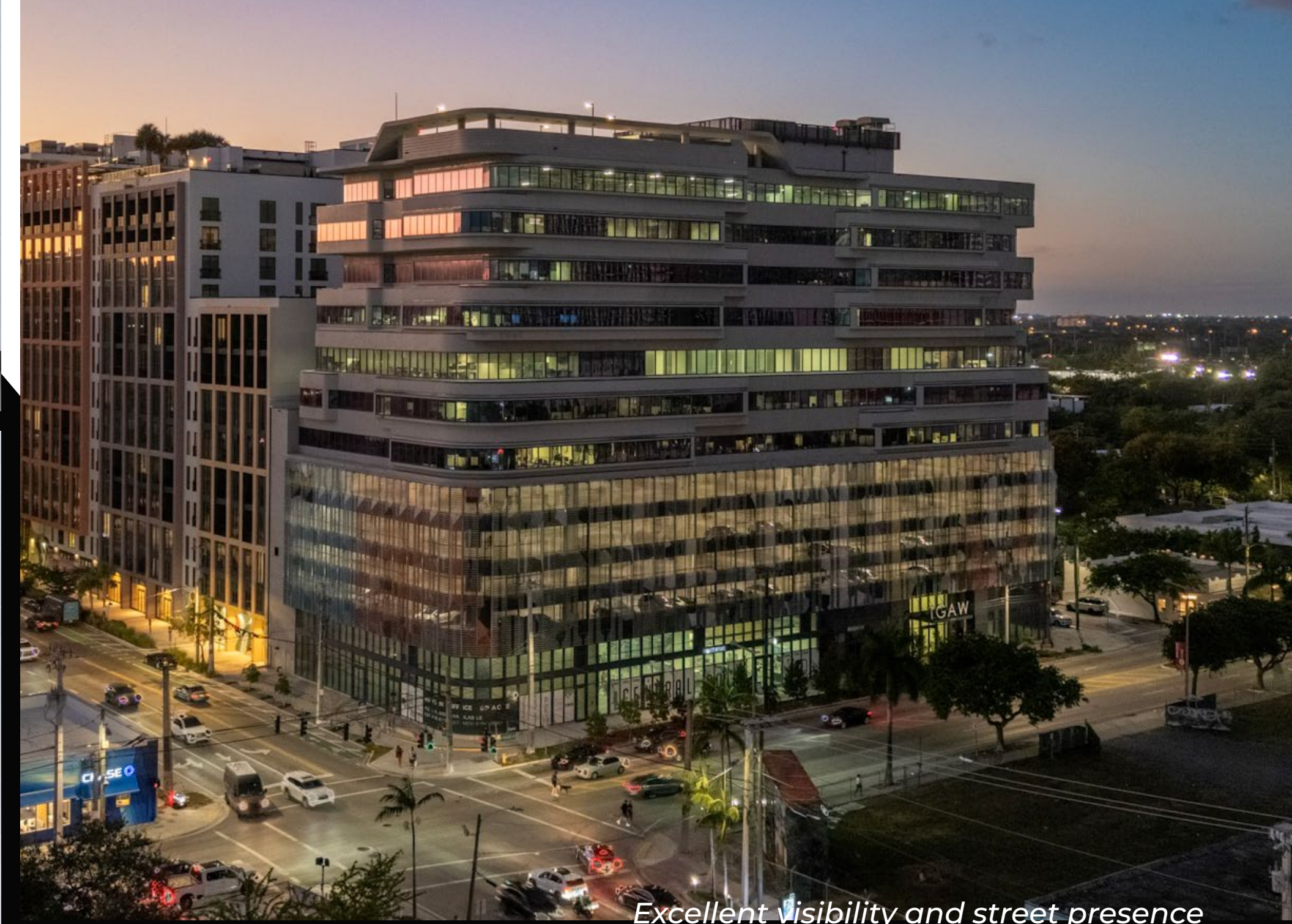
Excellent visibility and street presence